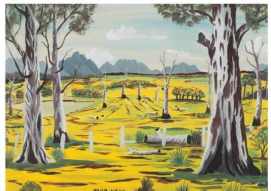
Landscape (with mountains)

Please ring ARTS Narrogin on 9881 6987 to arrange a time to come in.